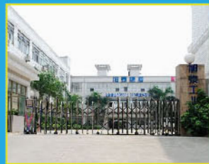
Industrial Park (Production)

To become century enterprise and get sustainable growth is our central goal, quality, integrity, innovation and responsibility are our power source. Our constant aim is to strike roots in China & HK and face the world, thus make great efforts to become one of the top leading manufacturers of portable power banks! We are on the way and your support is our treasury!