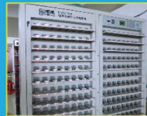
Charge & Discharge Test Assembly